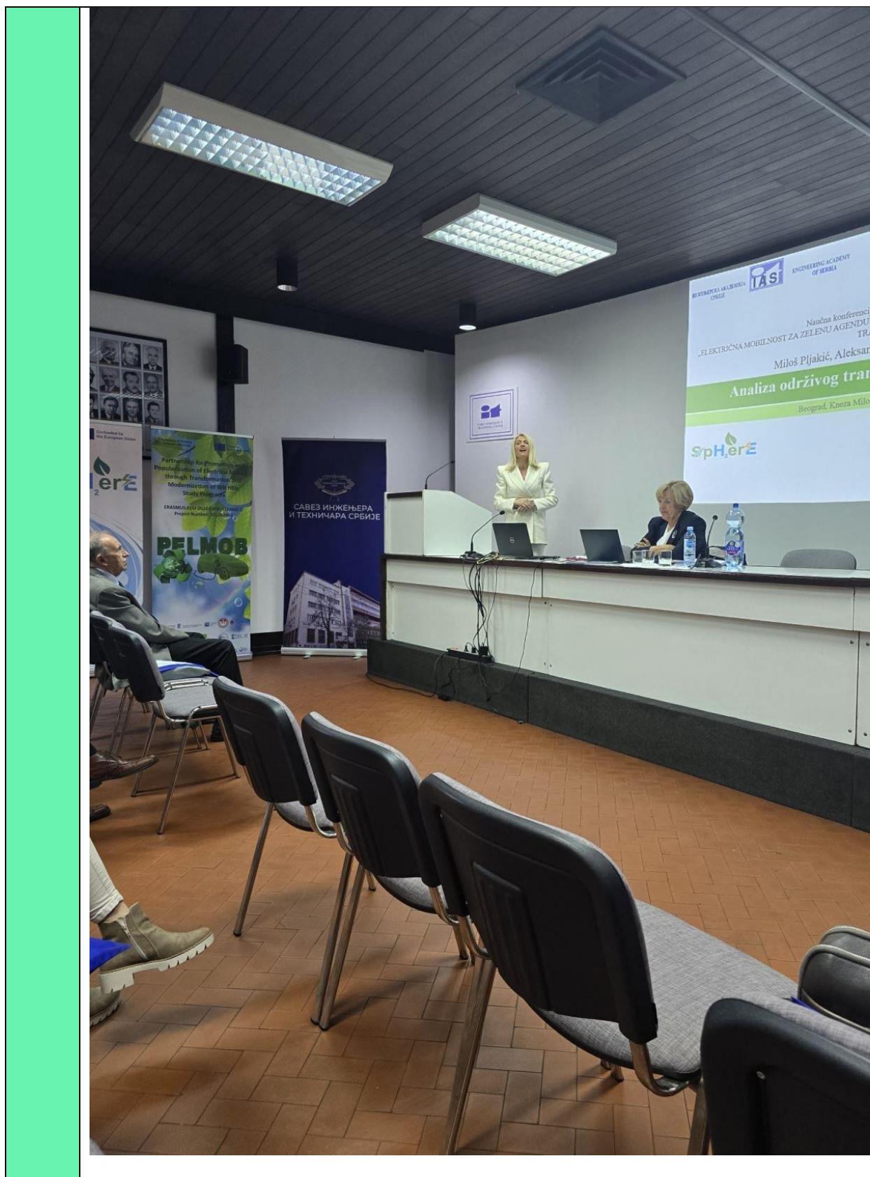
Sustainable transportation within the framework of green deal - SPHERE Call: ERASMUS-EDU-2023-CBHE-STRAND-2 Project Number: 101128065